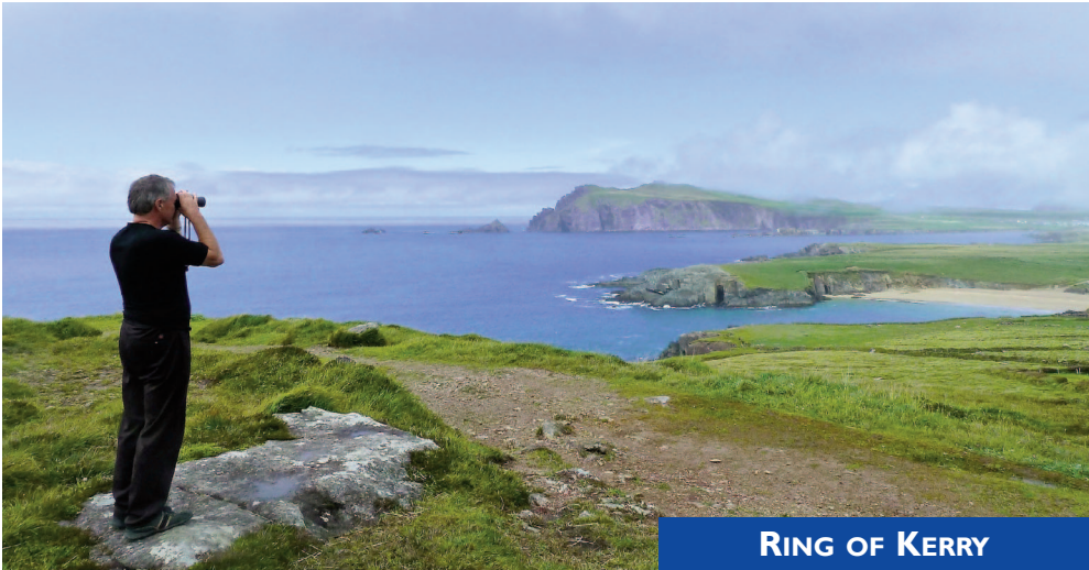
RING OF KERRY

You will depart Limerick this morning in route to Dublin. Along the way you will visit Cashel, the site of St. Patrick's Cross and the Rock of Cashel; Waterford, for a tour of the famous crystal factory; and Kilkenny, with its ancient town center, narrow medieval streets and merchant houses. You will arrive in Dublin for check in at the hotel and dinner at a local restaurant.