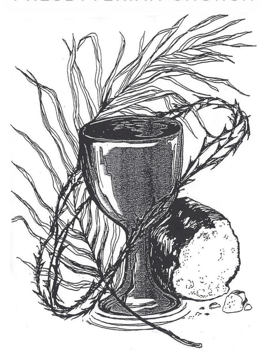
Called by God to be the heart, voice, hands and feet of Christ where the Spirit leads us.