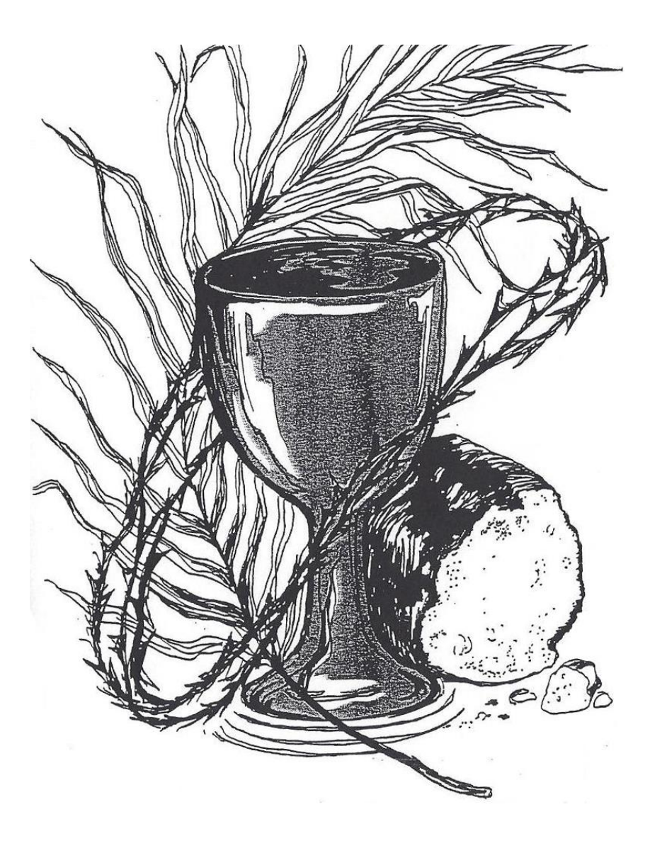
Called by God to be the heart, voice, hands and feet of Christ where the Spirit leads us.