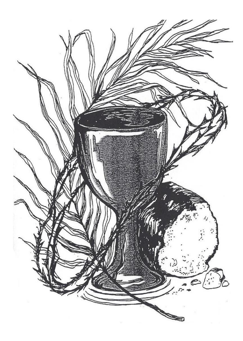
Called by God to be the heart, voice, hands and feet of Christ where the Spirit leads us.